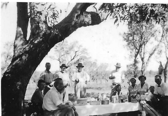
Opening Day 1958.