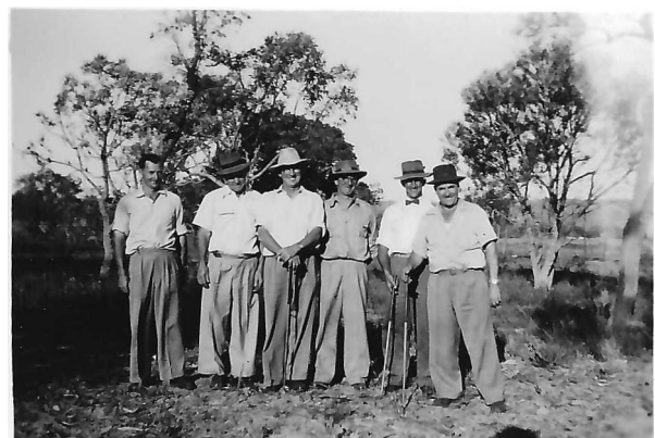
Again Opening Day 1958.